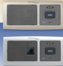
Front Door Stations with video options available in Bronze and Silver. Recessed door stations & room stations, Fascia: 265(w) x 130(h) Recess: 205(w) x 95(h) x 30(d)mm