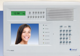
New M200 Compact Master Station with LCD video display and a host of new features. Fascia: 320(w) x 232(h) Recess: 280(w) x 190(h) x 75(d)mm