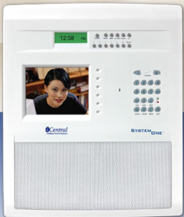
S1-M, S1-MV Traditional Master Station sized to retro-fit existing Valet and Electron master installations. Fascia: 320(w) x 390(h) Recess: 270(w) x 325(h) x 75(d)mm

* Maximum allowed number of all stations combined: 20 Max. Master Stations: 1 Max. Room Stations: 20 (if no master or door stations installed). Max. Door Stations: 3