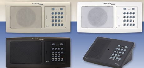
Room Stations are available in White, Ivory, Black and Silver. Recess mounted with surface mounting option. The surface mounted Desktop station is ideal for offices or garage applications.